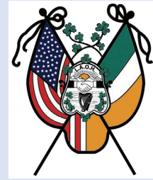
The Ladies Ancient Order of Hibernians, Inc.