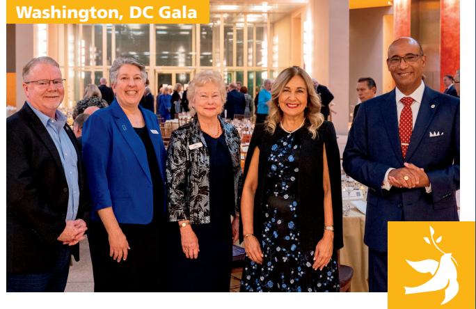
Washington, DC Gala