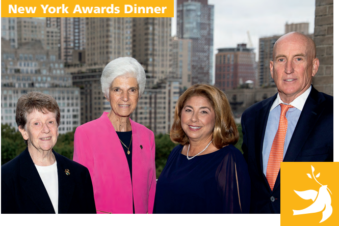
New York Awards Dinner