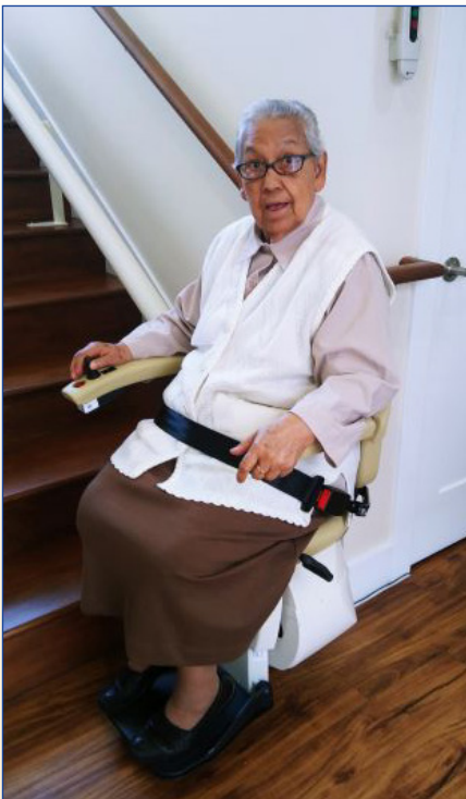
Stair lifts allow Sisters to remain active in their communities.

Sisters experience fewer aches and pains and greater comfort thanks to adjustable hospital beds provided by a SOAR! grant. The ability to move the beds to higher or lower levels allows elderly religious to safely transfer from their beds to a standing position or to a wheelchair.