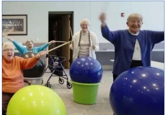
The cardio drum equipment is a hit with the Sisters of Notre Dame of Toledo, Ohio.

Our aging religious stay active and increase their strength thanks to therapeutic equipment purchased through a SOAR! grant. They improve their balance and coordination – decreasing the risk for falls and increasing their overall vitality.