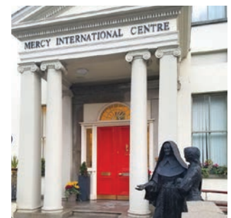
Mercy International Centre

Learn more online at www.soar-usa.org/ireland or contact Far Horizons at (877) 482-8747 or info@fhorizons.com .