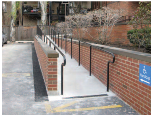
Far Left Photo: Chair ramp held together with duct tape. Second Photo from Left: Note with instructions not to operate chair ramp without assistance Third photo from left: Benedictine Chapel. Top Photo: Low-rise beds at Resurrection Life. All other Photos: Cenacle Ramp Construction to completion.