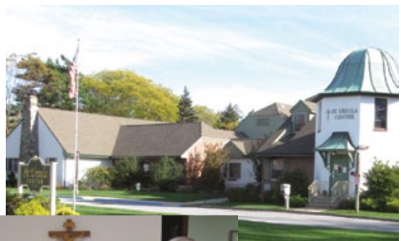
St. Ursula Center in Blue Point, NY is the retirement home for the aging Ursuline Sisters