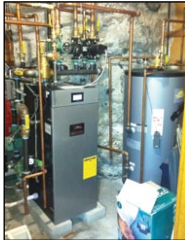
New boiler keeps the Sisters warm at the Medical Missionaries of Mary's home in Somerville

The impact of SOAR! grants was evident in every visit. The Medical Missionaries of Mary in Somerville have a home where Sisters live once they retire from their active ministry of providing medical care to those in need around the world. A new boiler, handicapped accessible bathrooms and a chair lift that runs from the basement to the 2 nd floor, were all made possible by the generosity of SOAR! donors.