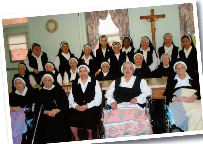
The retired Sisters of St. John the Baptist and the Sister Staff at Mt. St. John Retirement Convent pause for a 'family photo'.

SOAR! has just received more than 50 requests totaling over $1 million from aging religious congregations all over the country. Your generosity will help to meet those needs and allow the sisters and brothers who have given so faithfully throughout their lives to age with stability, dignity and comfort.