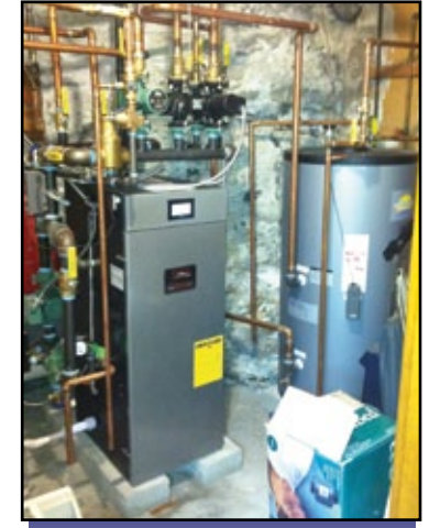
New boiler keeps the Sisters warm at the Medical Missionaries of Mary's home in Somerville

The Cistercians of the Strict Observance at Mt. St. Mary's Abbey in Wrentham received SOAR! grants that allowed them to install a security system to protect their Sisters struggling with